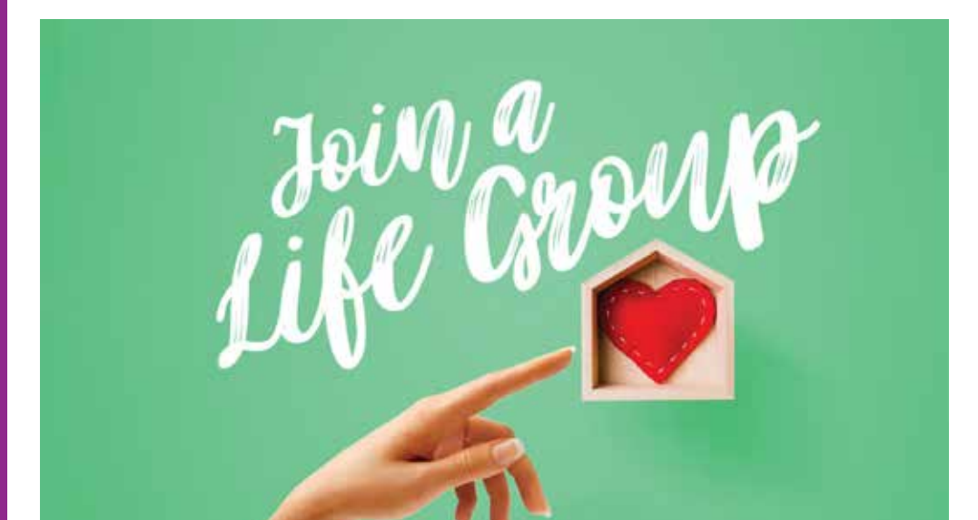
Community - Life Group