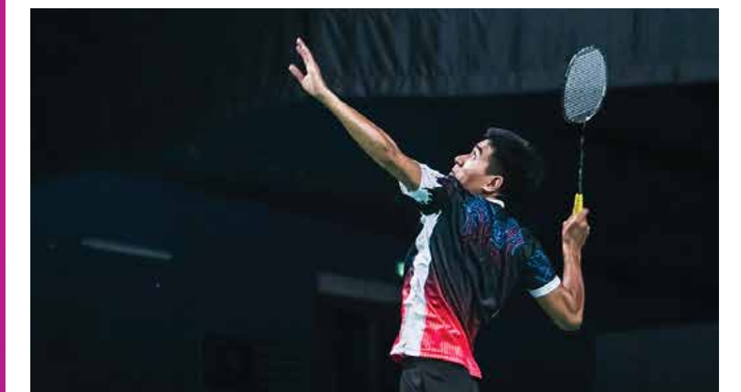
Sports - Badminton, futsal, hiking