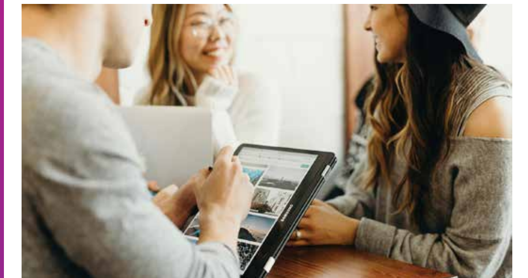
Entrepreneur - Empowering lives