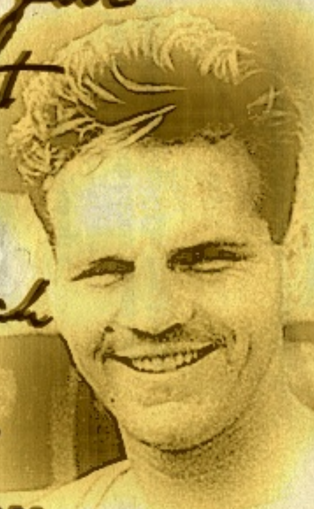
- JIM ELLIOT, 1927-1956

He is no fool who gives what he cannot keep to gain that which he cannot lose.