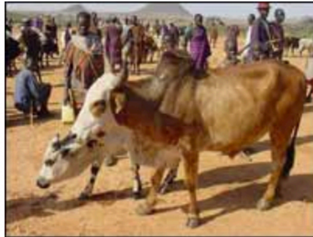
Cattle rustling is a major problem in north-east Uganda

A Ugandan woman has been reunited with her cows who recognised her voice and followed her.