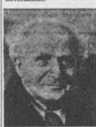
David Ben Gurion, Prime Minister

The creation of "Medinat Yisrael", the State of Israel, was proclaimed at midnight on Friday by Mr. David Ben Gurion, until then Chairman of the Jewish Agency Executive and now head of the State's Provisional Council of Government.