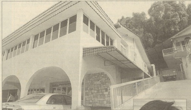
The Women's Shelter Home in Salak South Baru.

They also have nine full-time staff and volunteers